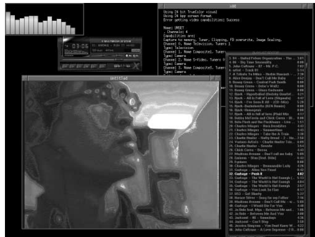
Figure 2: Screenshot of computationally altered live video in which the environment appears to swirl and pulse to the beat of the wearer's heart.

We combined our EyeTap system with common wearable personal sound systems. Our EyeTap eyeglasses based implementation currently allows the video to "saturate" between beats (i.e. video frames are superimposed on top of one another), and then clear to a fresh video frame on either a heart beat or a musical beat. Musical bass beats were detected by analyzing the spectrum analyzer output from software music player. The real time video saturation effect was achieved by applying the X-windows GXand GXor functions to the updated video. It was found that this system created the impression of visual reality cardiographically and musically pulsating along with the beat of the heart, allowing the music to be experienced both visually and aurally. The physiological control system allowed the user's emotional response to further affect the system, and this, in turn, further affected their experience and emotional response, thus creating a closed loop feedback system.